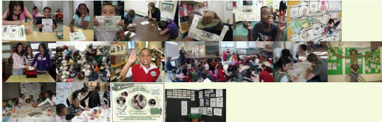
Fundred in the Classroom